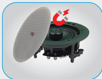
Magnetic Fit Steel Frame