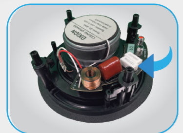
Premiune frequency filter