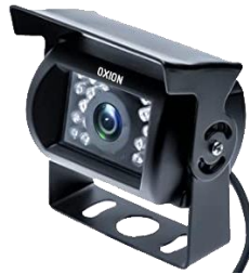
Side View OX-IPC22V-OS