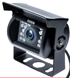
Rear/Front View OX-IPC22V-OR