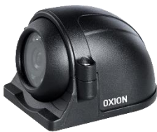
Side View OX-IPC22V-OS