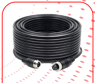
Aviation Cables OX-MCB-5/10/15 M