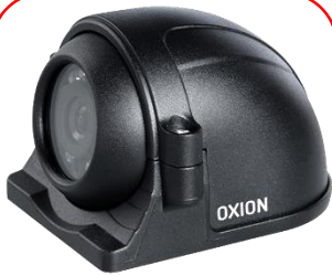
Side View OX-IPC22V-OR