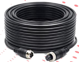
Aviation Cables OX-MCB-5/10/15 M